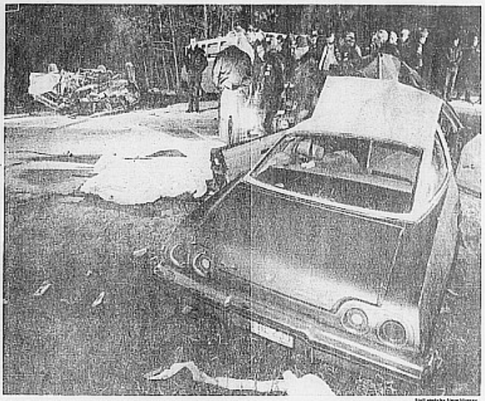
Bodies lie covered between smoshed cars in wreck at Shatwell

Raleigh, N.C., Thursday, December 30, 1976