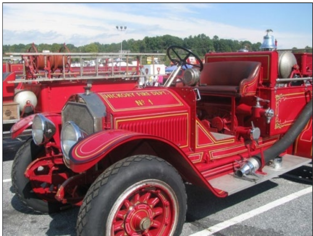
Hickory's first fire engine, a 1914 ALF Type 10 combination hose and chemical car (#484). Presently privately owned by a collector in Granite Falls, NC.