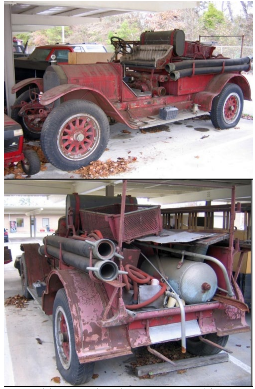
Newton's first rig is waiting for some loving, a 1921 ALF Type 40 triple (#3371).