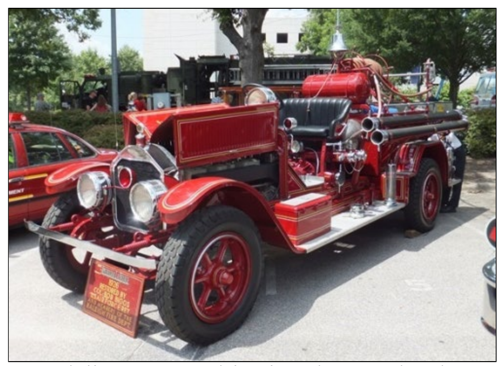
Raleigh's 1926 ALF Type 75 triple (#5629). Housed at Station 28 along with the city's other antique apparatus.

The City of Hickory has three of their early American LaFrances that are keeping each other company. They include a pair purchased in 1924 with sequential purchase order and serial numbers. One is a Type 75 triple combination and the other is a Type 14 service ladder truck. Below are a photos and information about some of these trucks.