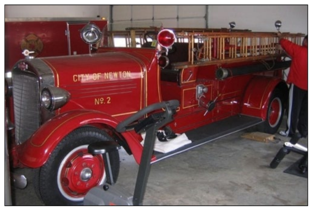
Newton's 1937 ALF Type 475CB (#L-887) is housed at Station 3 in Startown and waiting for room at the Catawba Fire Museum.