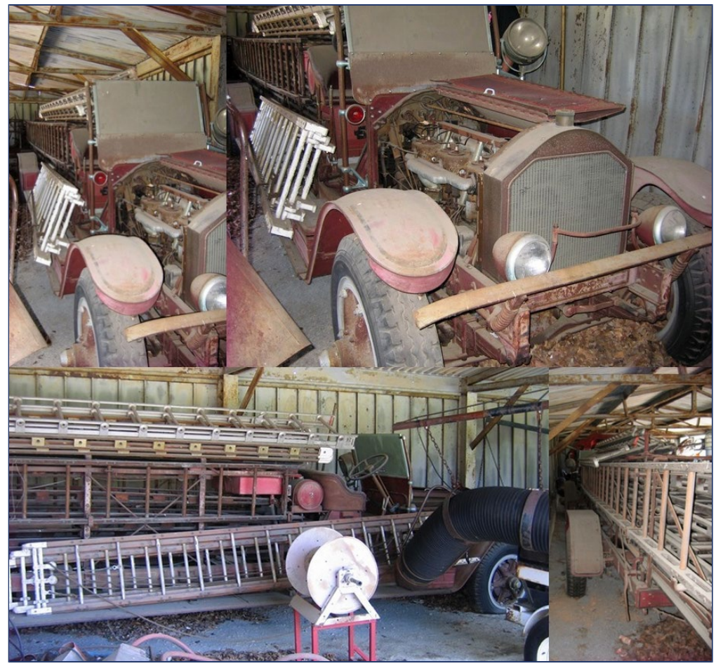
Closer views of the ladder truck, click above photo to enlarge.