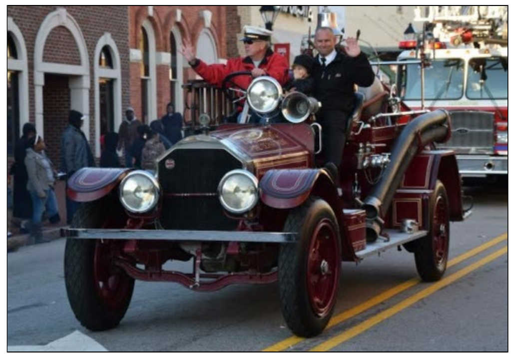
Louisburg's 1921 ALF Type 75 triple (#3682) is named "Maude" and is shown in a Christmas parade.