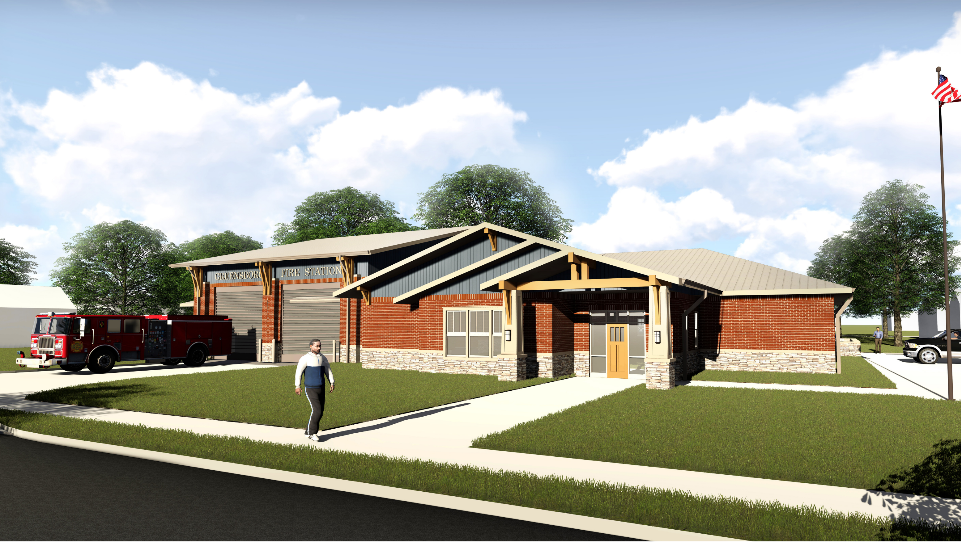
Greensboro Fire Station 56 Schematic Design 08.23.18