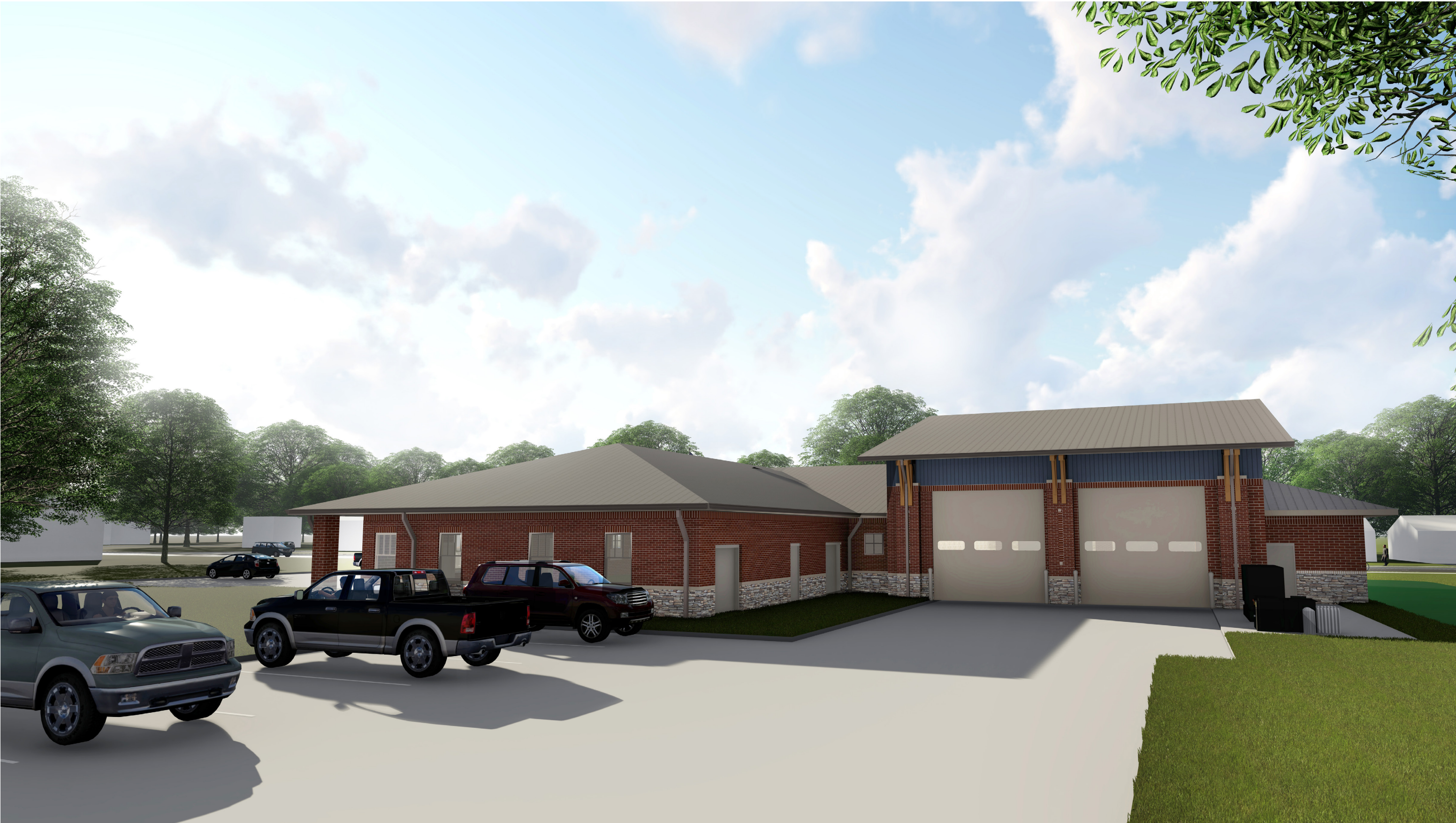
Greensboro Fire Station 56 Schematic Design 08.23.18