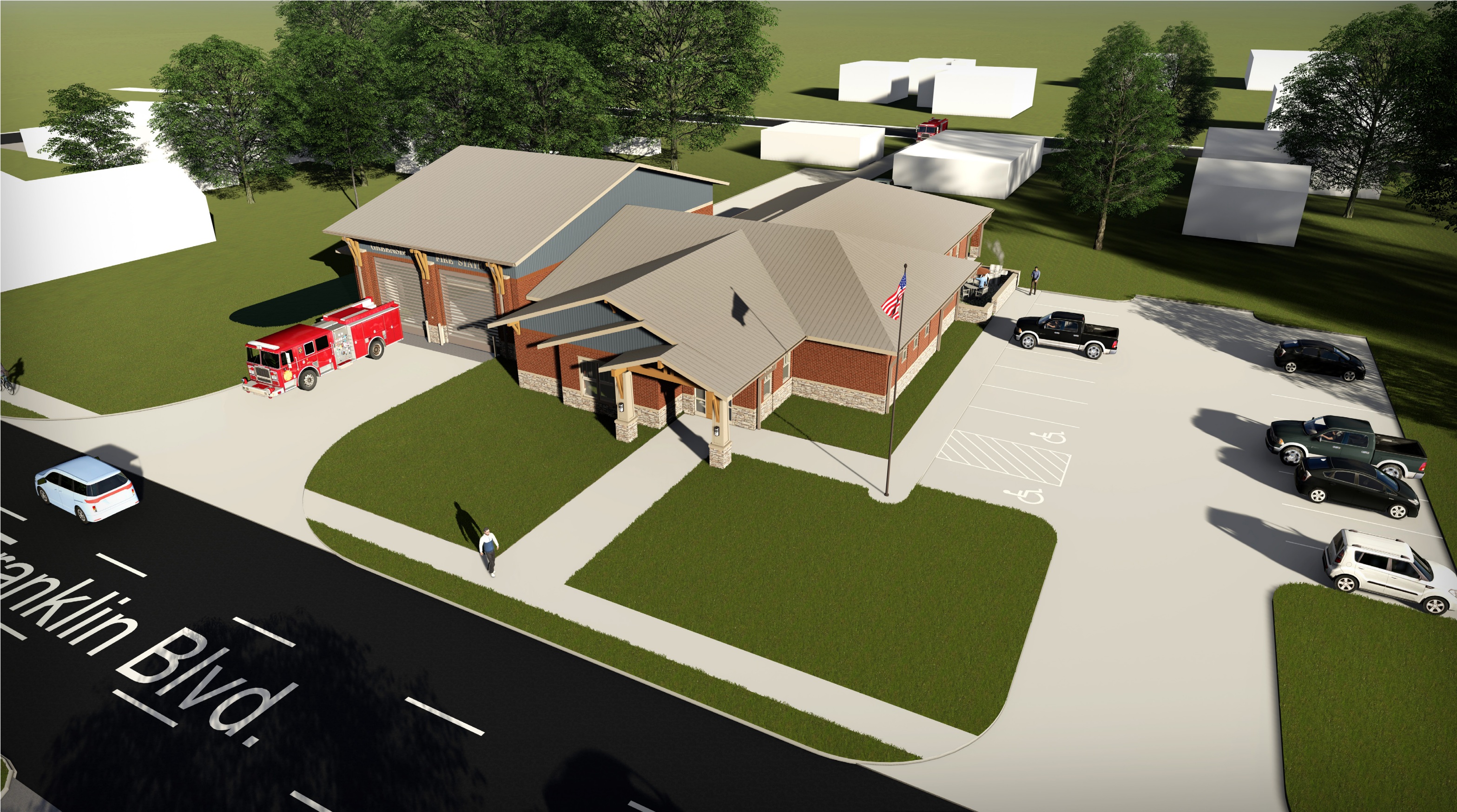
Greensboro Fire Station 56 Schematic Design 08.23.18