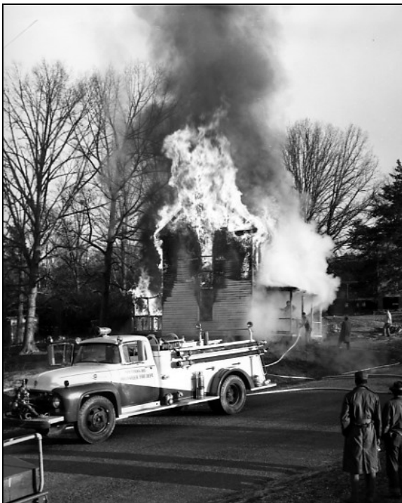
Six Forks Fire Department, 1957