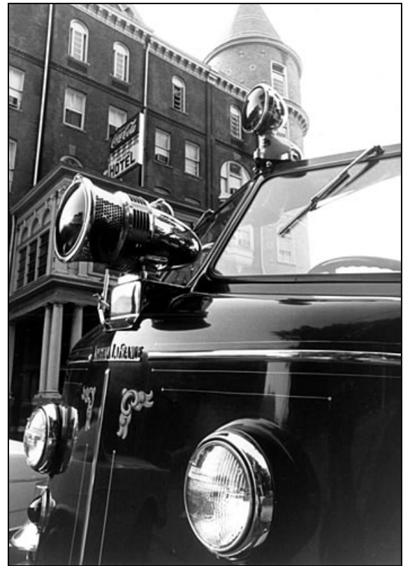
Park Hotel, 1961

The Images of America series celebrates the history of neighborhoods, towns, and cities across the country. Using archival photographs, each title presents the distinctive stories from the past that shape the character of the community today. Arcadia is proud to play a part in the preservation of local heritage, making history available to all.