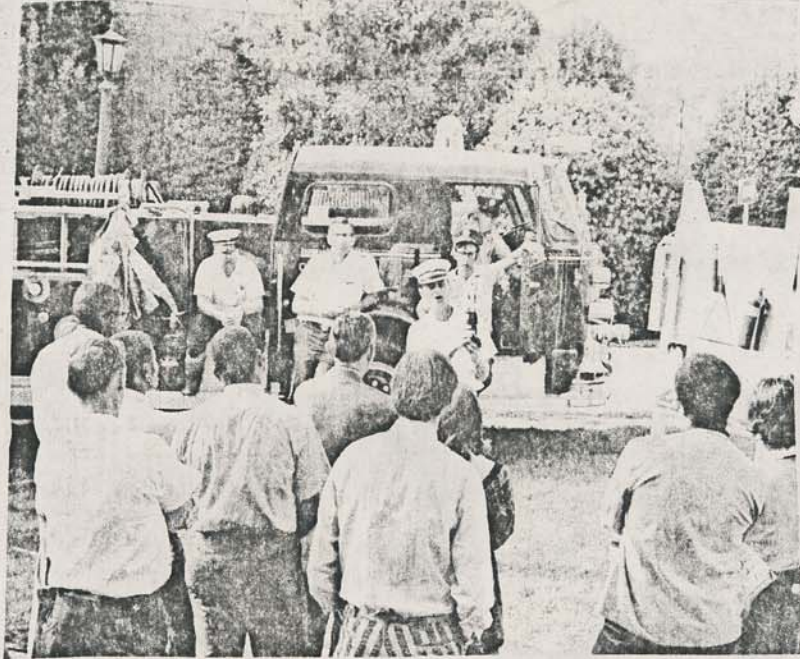
"Know your ABC's of Portable Fire Extinguishers", urged the Chapel Hill Fire Department at yesterday's demonstration on the use of fire fighting equipment.