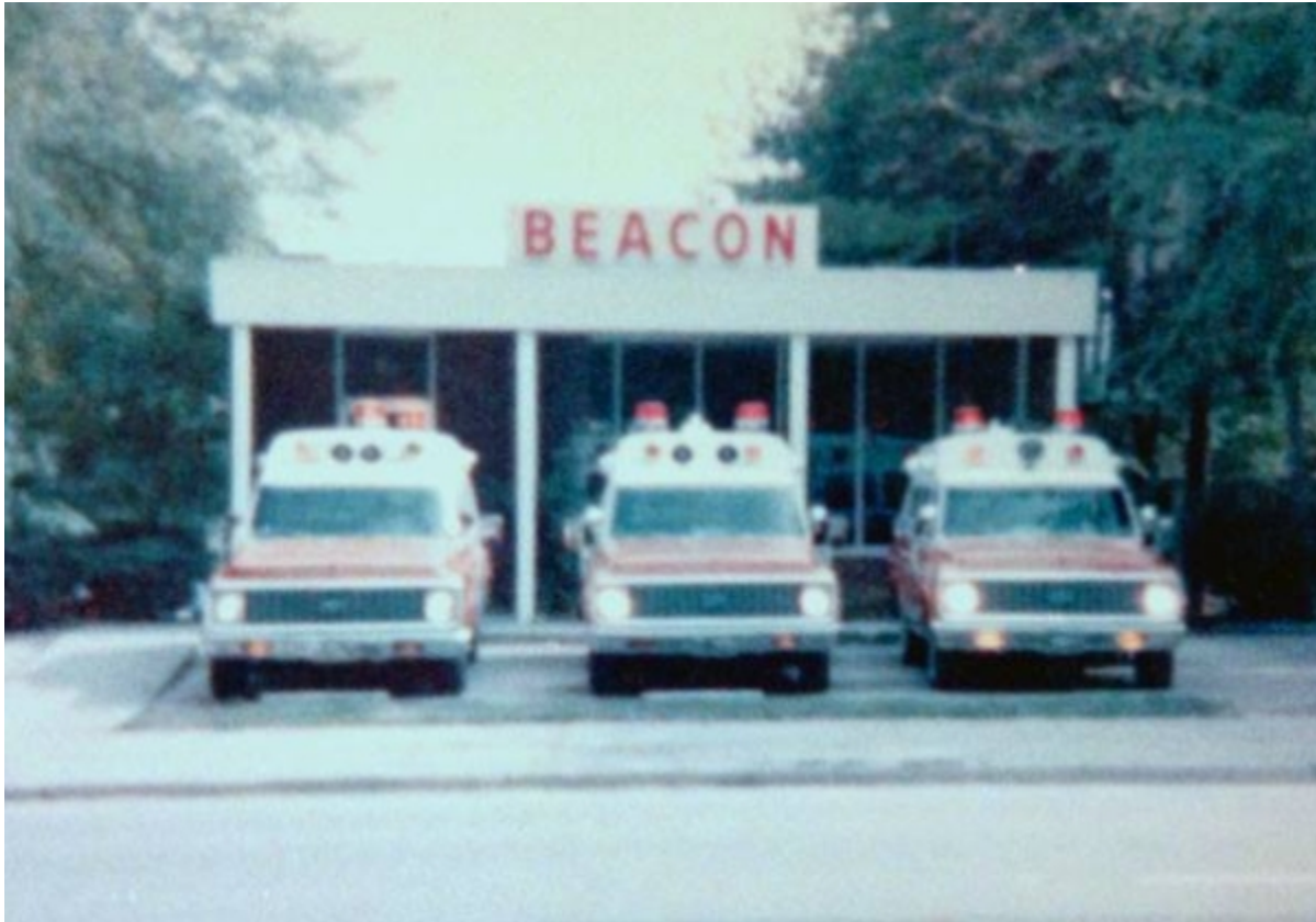
Beacon ambulance on Hillsborough Street in the early 1970s

In May 1972, there were several emergency ambulance providers in Raleigh and Wake County, including: