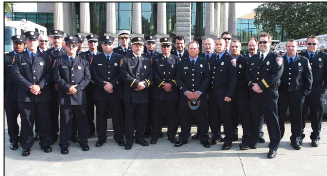
Raleigh and Cary personnel pose at the Progress Energy Center, before the annual Wake County EMS System Cardiac Saves ceremony on May 18.