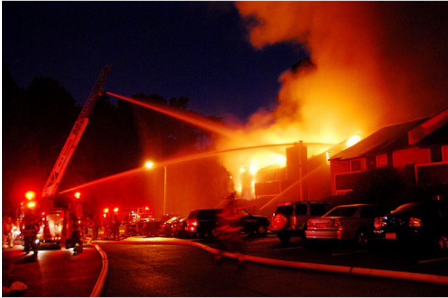
Apartment fire at 6305 Shanda Drive on June 25. Engine 15 was first on scene. Two alarms.