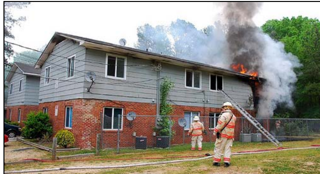
Apartment fire at 537 Dacian Road on April 30. Engine 12 was first on scene.