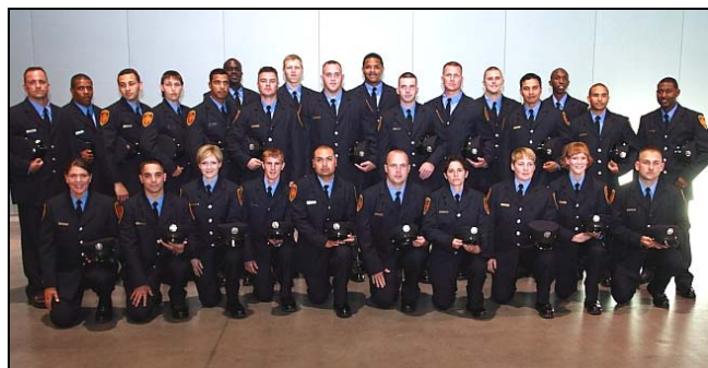
Recruit Academy 36 poses before graduation at the Raleigh Convention Center on April 17. ■