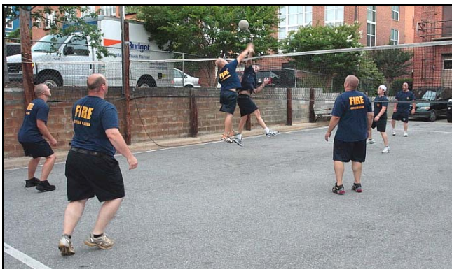
C-shift personnel play a familiar game of volleyball behind Station 1 on June 3. No photographer was harmed during the making of this newsletter.

SEE MORE PHOTOS AT: WWW.RALEIGHFIRENEWS.ORG