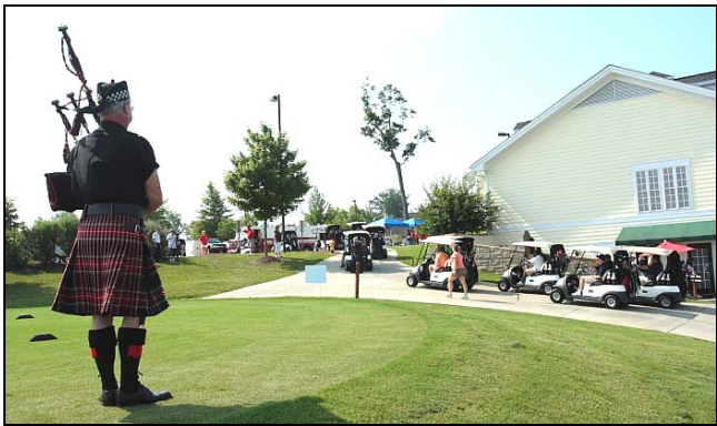
Players hit the links at the Third Annual National Fallen Firefighters Golf Tournament on June 11 at Eagle Ridge Golf Club in Raleigh. The event raised $8,238 for the National Fallen Firefighters Foundation.