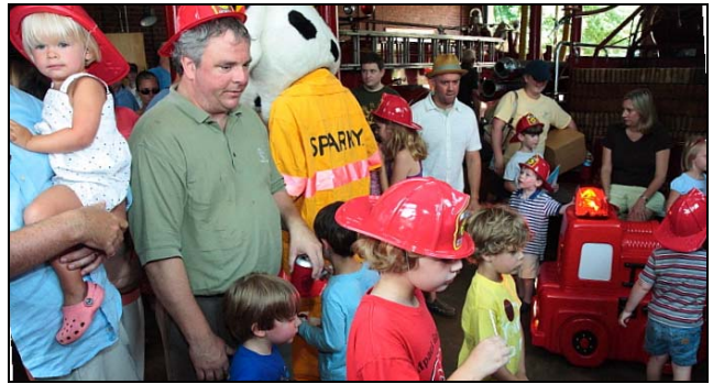
Station 6 open house and birthday party on June 27.

SEE MORE PHOTOS AT: WWW.RALEIGHFIRENEWS.ORG