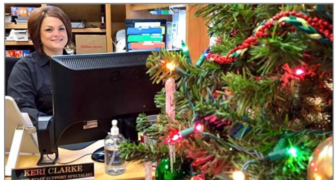
Decorated for the holidays. But where's the Festivus pole?

The NC National Guard and US Coast Guard assisted the fire department with creating plume models. ■