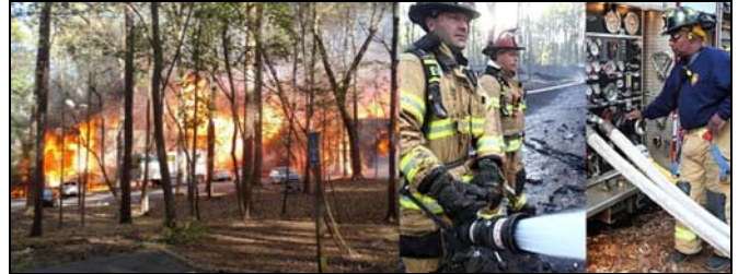
WCNC photo left

Two alarms were struck at an apartment fire early Saturday evening, April 9. Engine 16 arrived at 5034 Edwards Mill Road and found the two-story, elevated building entirely involved in flames.