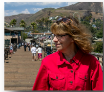
Crazy wigs! Crazier shirts! Kidney stones!