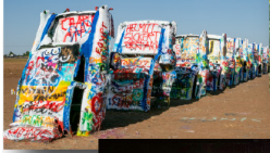
Merely 2,356 miles!