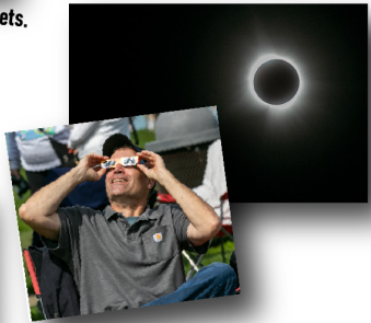
Smaller solo trips: Ohio for eclipse viewing (April) and Boone, NC, for leaf peeping (October).